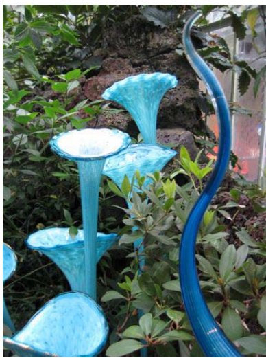
Dale Chihuly art: blue glass trumpet flowers (above) & large glass orange leaf forms (below).