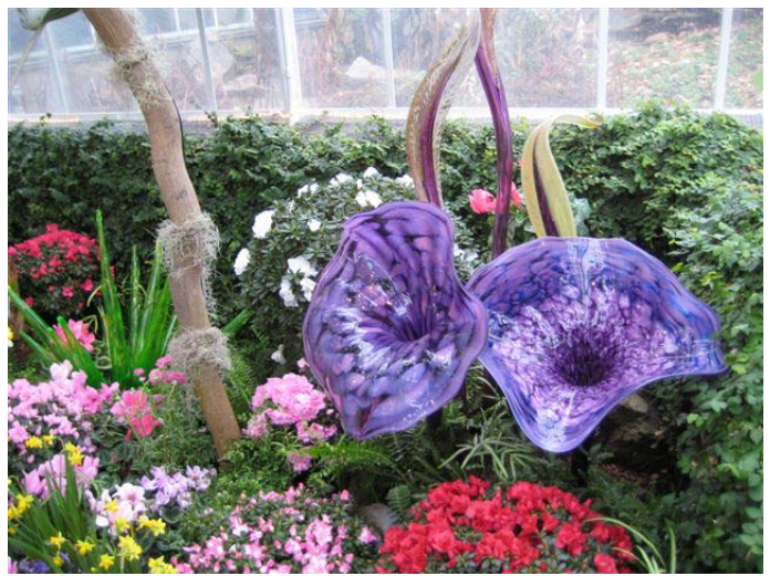
More Chihuly art: giant purple petunias copper (above) & gold spirals (below).