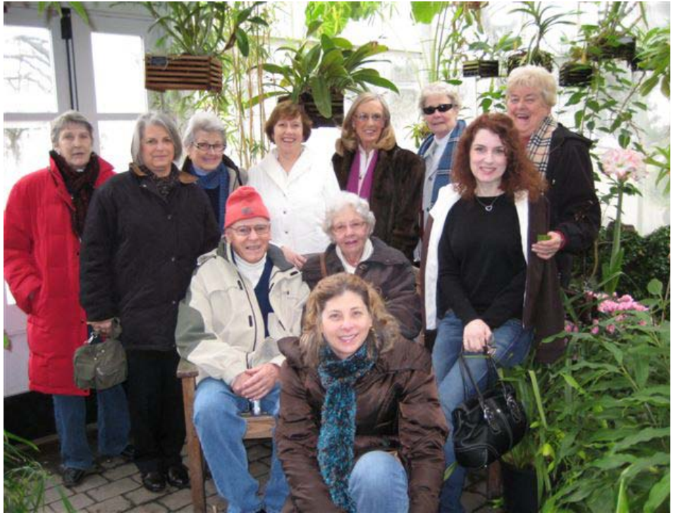
The Garden Club group visits the Dale Chihuly art glass in the W. W. Seymour Botanical Conservatory at Wright Park.